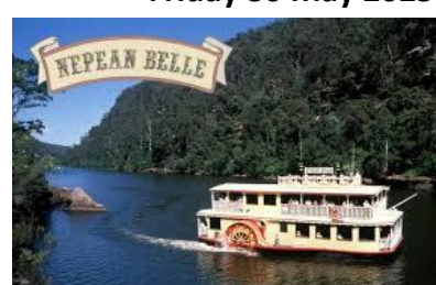
Friday 30 May 2025

Following breakfast, we make our way down the mountains to Penrith where upon our arrival, we board the Nepean Belle for a luncheon cruise on the Nepean River, with the opulent scenery of the Blue Mountains National Park around us. The Nepean Belle is a romantic old-world style Paddlewheeler. Reflecting the grace and charm of yester-year, the "Belle's" interiors are