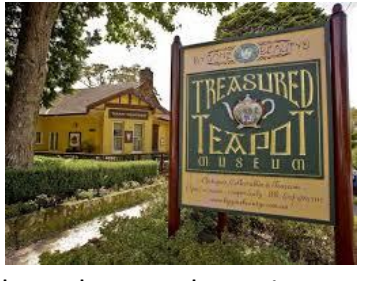
Thursday 29 May 2025

keepsake in the Retail Emporium following our tour through the museum. To stretch our legs, we have time to